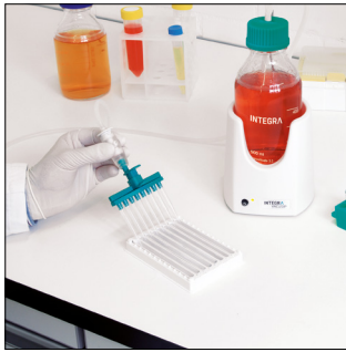
Aspiration from western blot strips