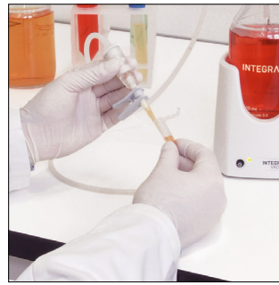
Aspiration of supernatants