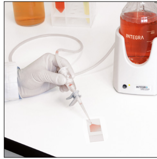
Removal of excess liquid from object slides