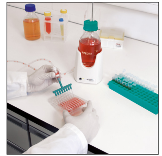
Removal of washing solutions