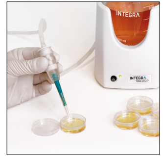
Removal of culture media