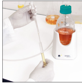
Supernatant removal to harvest bacteria