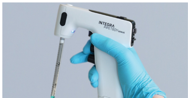
2: ...aspirate as much liquid as you want...