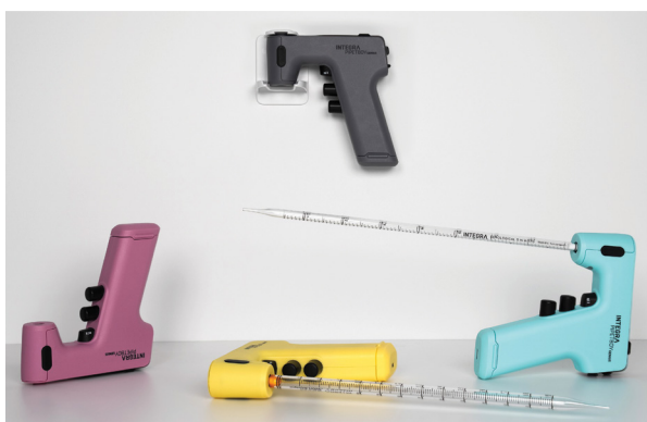
On the table