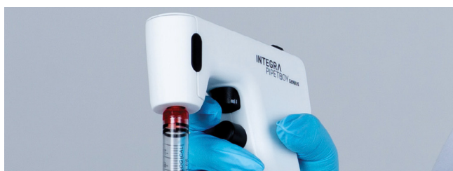
3: ...and press button to dispense the aliquot.