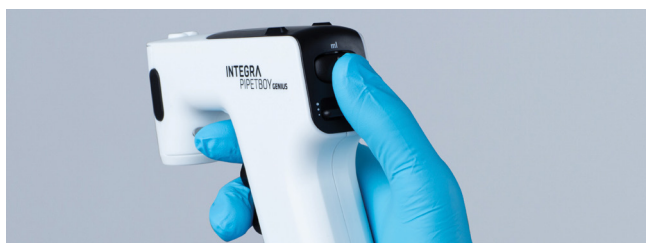
1: Set the dispense volume...

The risk of variation or errors due to manual dispensing is reduced, as every dispense is controlled by the instrument. This is highly reproducible, and more precise than dispensing by eye.