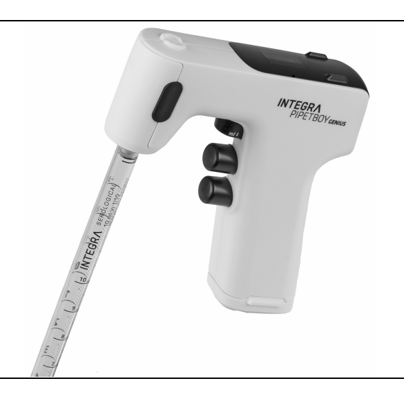
PIPETBOY GENIUS Operating instructions